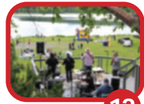
13-OTTER LAKE LODGE & PAVILIONS (NOT LOCATED ON MAP)